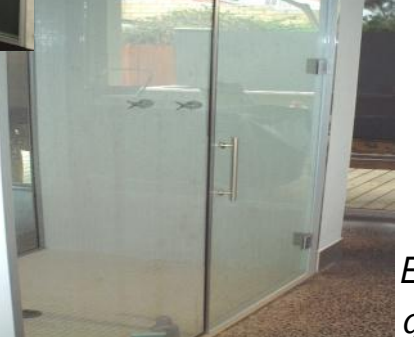
Frameless Shower Screen